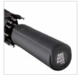
Handle with promotional labelling option