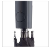
Soft-Touch handle with push-button