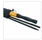
Umbrella and two-section foldable lower shaft closed 71 cm length only