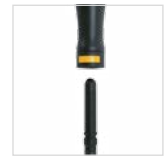
Handle with coloured push-button