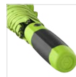
Soft-Touch handle with promotional labelling option